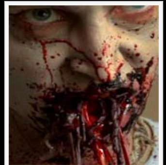
This one may be a bit more difficult.